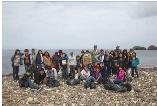
Students from Cleveland School on Santa Cruz Island

You may think Santa Barbara Cleveland School's mascot is the Dolphins, but for a couple of days in early May they became the Cleveland Clippers. That's because each sixth grade class spent a day on Santa Cruz Island clipping the heads off of thousands of non-native oyster plants ( Tragopogon porrifolius ). This invasive plant is native to Europe and known for its edible roots that taste like oysters. However, in the U.S., like most invasive plants, the oyster plant has aggressively spread, smothering out native plants along the way, and has established itself as a roadside weed in nearly every state.