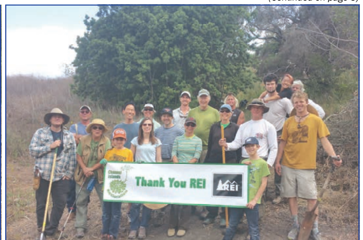
Volunteers pose after completing restoration work. Left: Via Gaitero entrance. Right: at the Spring near the Antone Road entrance to the Preserve