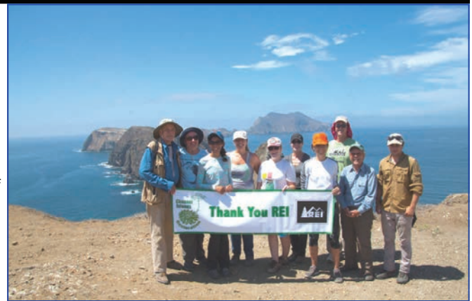
Photo on right: Volunteers at Inspiration Point on East Anacapa Island.

Through our partnership with REI, we intend to build a greater awareness of our efforts to care for and showcase Anacapa Island—part of the Channel Islands National Park, and a recreational paradise enjoyed by hikers, paddlers, birders, and campers. We are proud to partner with this sponsor and excited to share the news of their investment in our organization and mission. CIR is proud to work with the National Park Service and REI on this important restoration project.