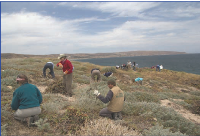
CIR staff and volunteers remove iceplant on Santa Rosa Island

CIR is excited to offer a series of restoration trips to Santa Rosa Island this fall, in partnership with Channel Islands National Park. Supported by Channel Islands National Park, these 4- and 5-day trips are designed to accomplish important environmental restoration projects, while giving volunteers the opportunity to experience some of the most beautiful and remote sections of that vast island.