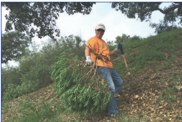
Volunteer removes a mature Euphorbia plant.

Since January, CIR has been involved in a mainland restoration project at Mission Canyon in Santa Barbara to help eradicate a growing population of an extremely invasive plant, Carnation Spurge ( Euphorbia terracina ). This plant was recently discovered spreading through this residential area, down the road from the Santa Barbara Botanic Gardens, and its proliferation has exploded with the late winter rains. With grant funding from the California Department of Food and Agriculture, the County of Santa Barbara partnered with CIR to stop Carnation Spurge in its tracks and to keep it from spreading even further.