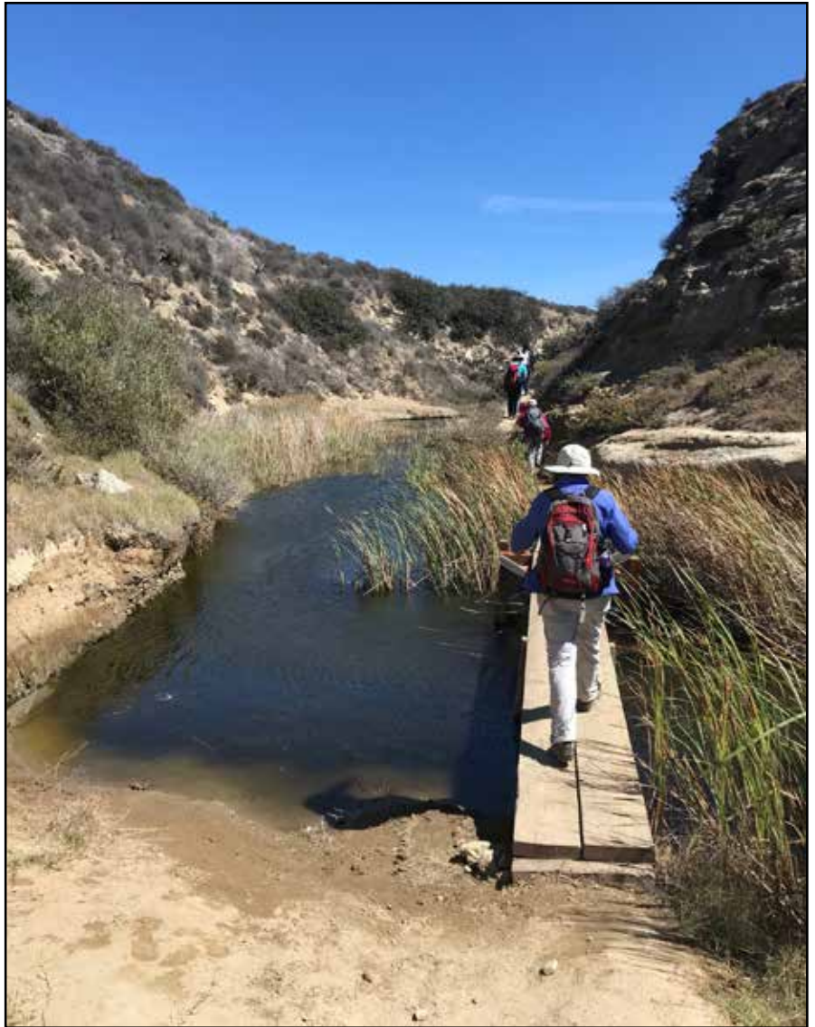
A guest walks across Water Canyon during our recent visit to Santa Rosa Island.

Held in celebration of the September 22nd equinox, the Autumn Equinox Cruise was our first education only island trip, with seven distinct island adventures to choose from, each led by a different scientific expert or experienced field guide. Trip leaders incorporated a range of knowledge into their programs, from descriptions of island ecology and geology to teaching about the anthropology and history of Santa Rosa Island and the Channel Islands.