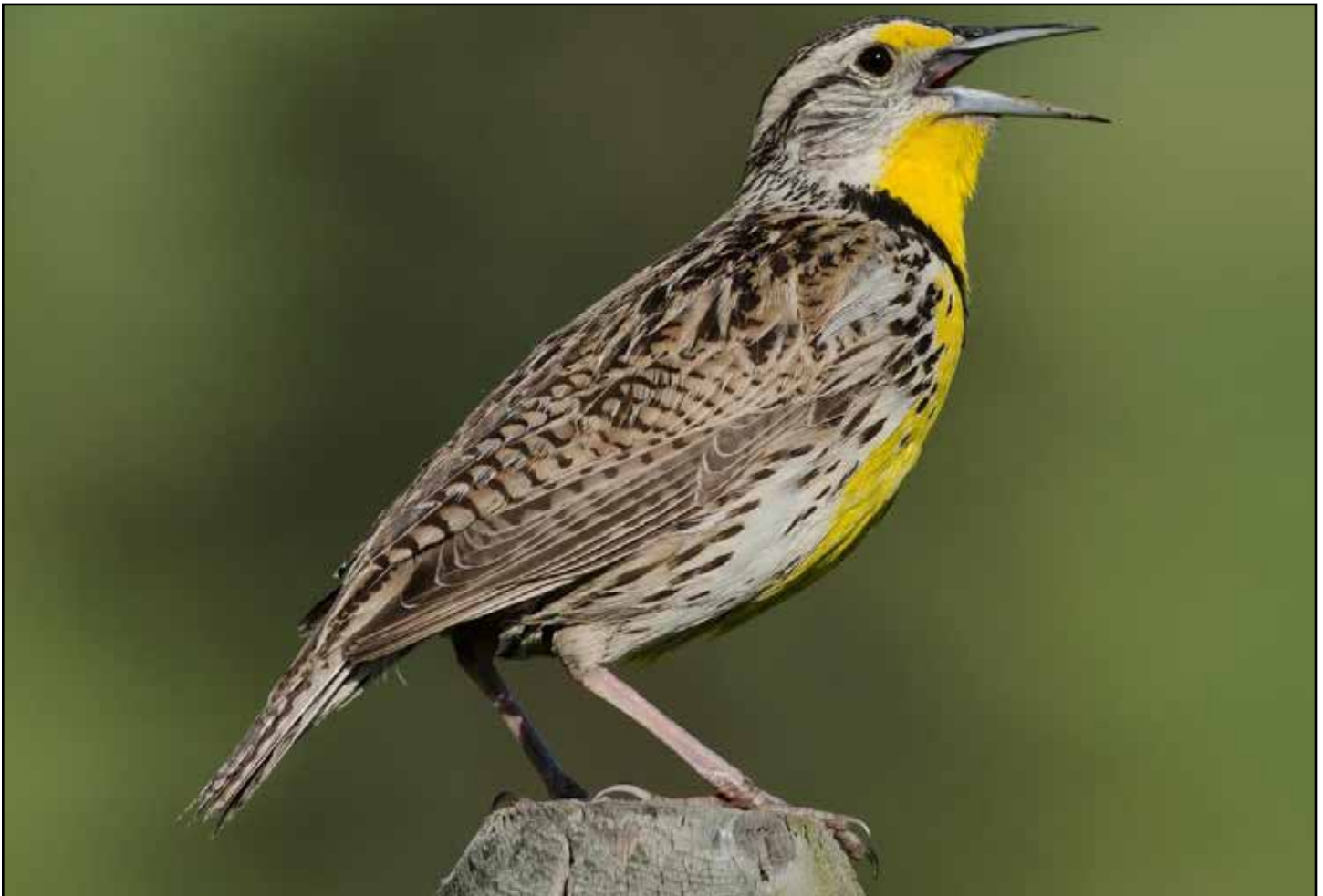
A live Meadowlark sings. Western Meadowlark males sing on breeding grounds.

If you can support this project, please contact me at eliu@cirweb.org .