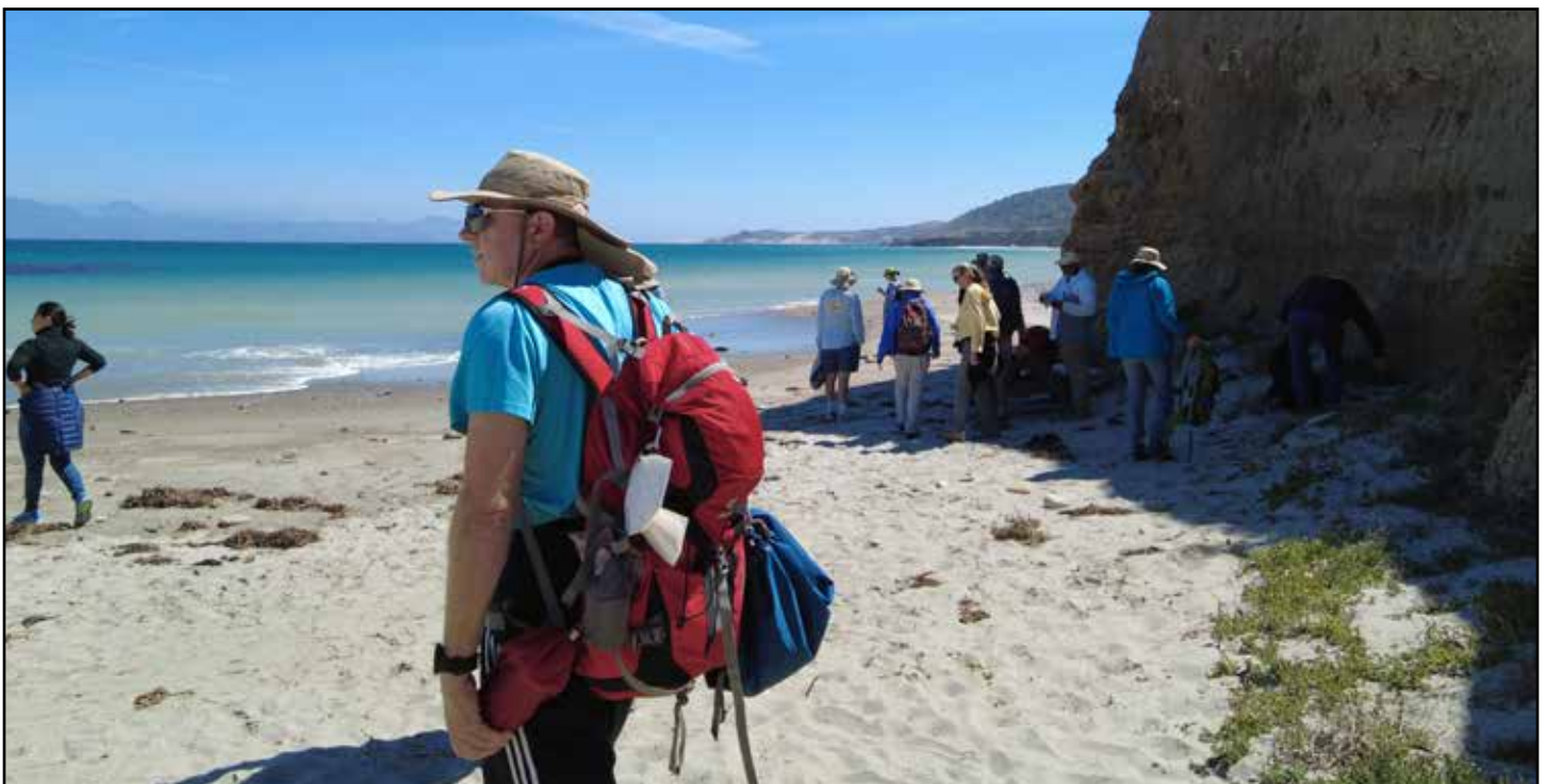
Guests eat lunch at Water Canyon beach, carrying their day packs and enjoying the beautiful views.

Our adventure wound to a close as our vessel backed out of Painted Cave and headed for home, accompanied by groups of short-beaked common dolphins and plunge diving brown pelicans, providing a wonderful reminder of the extraordinary biodiversity and stunning vistas of the Channel Islands. We are excited to have shared a small portion of this special place with our guests. We plan to make the Autumn Equinox cruise an annual excursion and look forward to next year's trip to experience the uniqueness of this special archipelago.