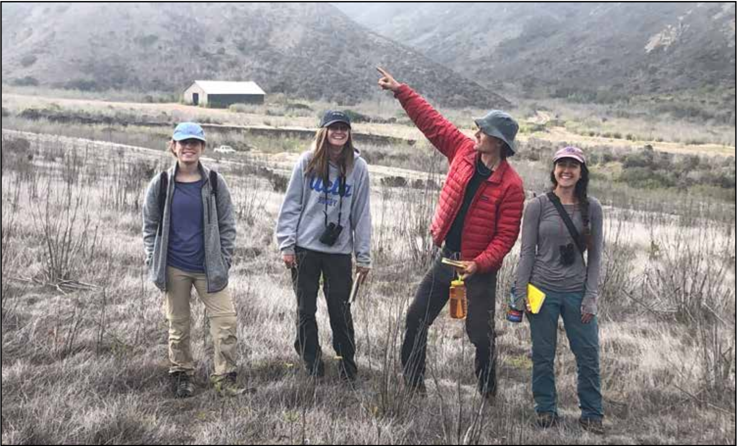
Interns gather on Santa Cruz Island in July 2021 to help observe if Western Meadowlark populations on each island have distinct song repertoires that are distinct from those of their mainland counterparts and from repertoires of populations on other islands.