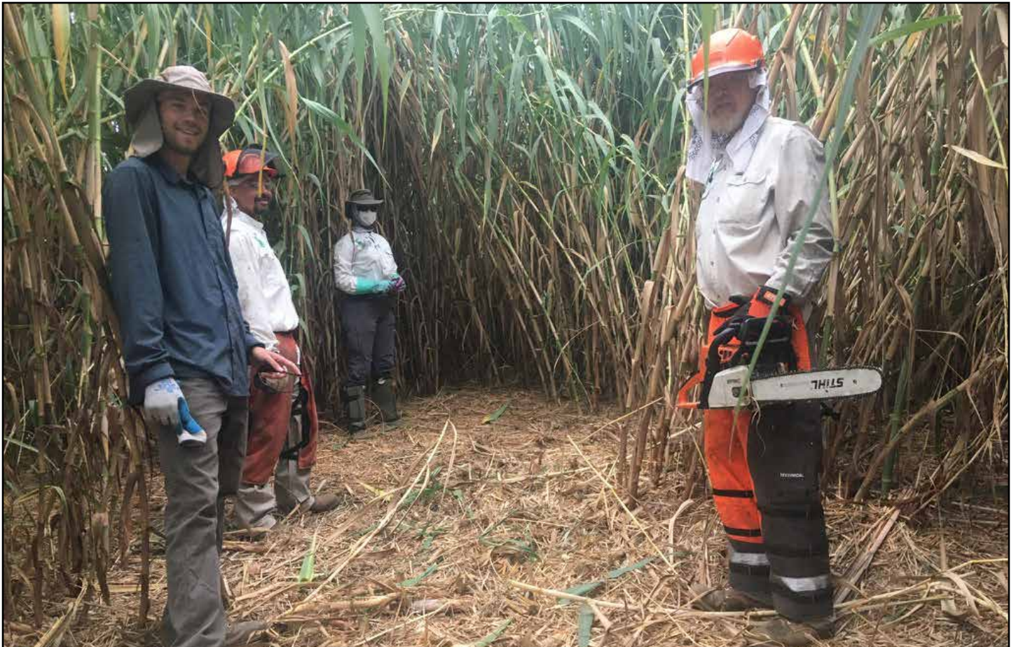
The team uses chainsaws to free native trees and vegetation from Arundo monocultures.