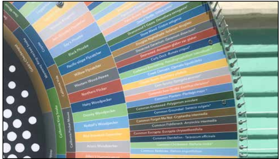
A closeup of the Foothills Forever wheel, displaying the multitude of species living at the Foothills.

The next time I visited, I saw coyotes, barn owls, a mountain king snake, and - what? Fifteen foot story-poles standing in the grassland, to show where the luxury houses would be built. Eight houses on 101 acres may sound small, but I knew from working in architecture, it would not just be