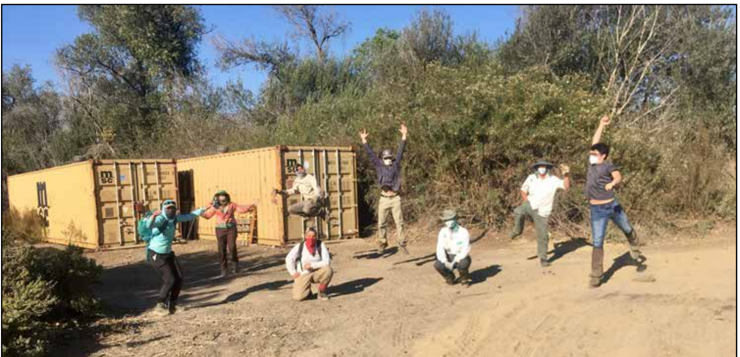
The Channel Islands Restoration Santa Clara River Arundo removal team!

Also known as giant reed, Arundo provides limited shade along bank edges compared to native trees such willow or cottonwood which results in warmer stream temperatures. This damages to the natural cooling aspect of riparian corridors which contribute to healthy climate conditions. The dense monoculture it creates also denatures habitat for native flora and fauna as well as damming and channelizing the dynamic alluvial washes and main stem