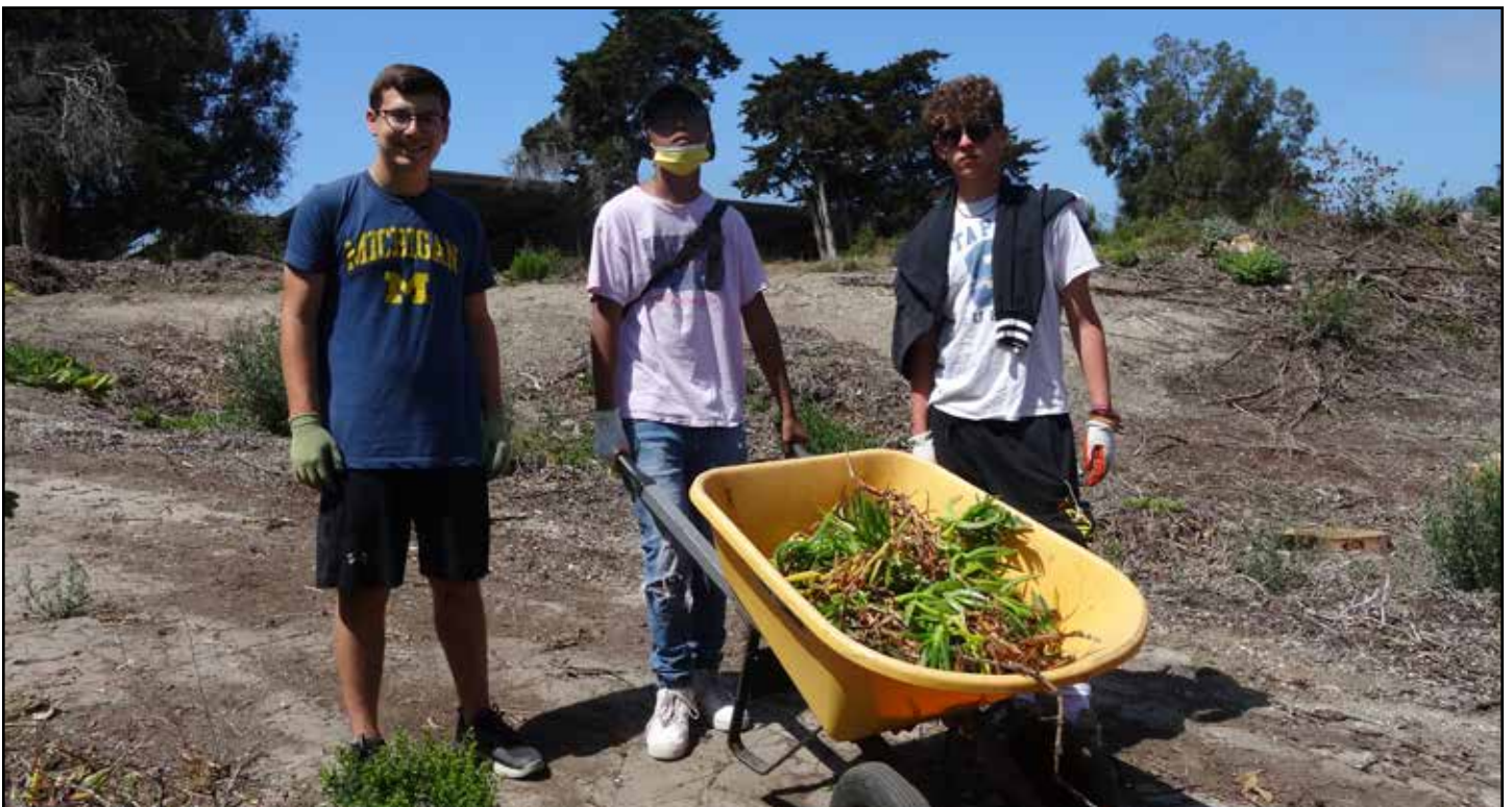
Students from REIN Teen Tours remove ice plant as part of their service opportunity at the UCSB North Campus Open Space.