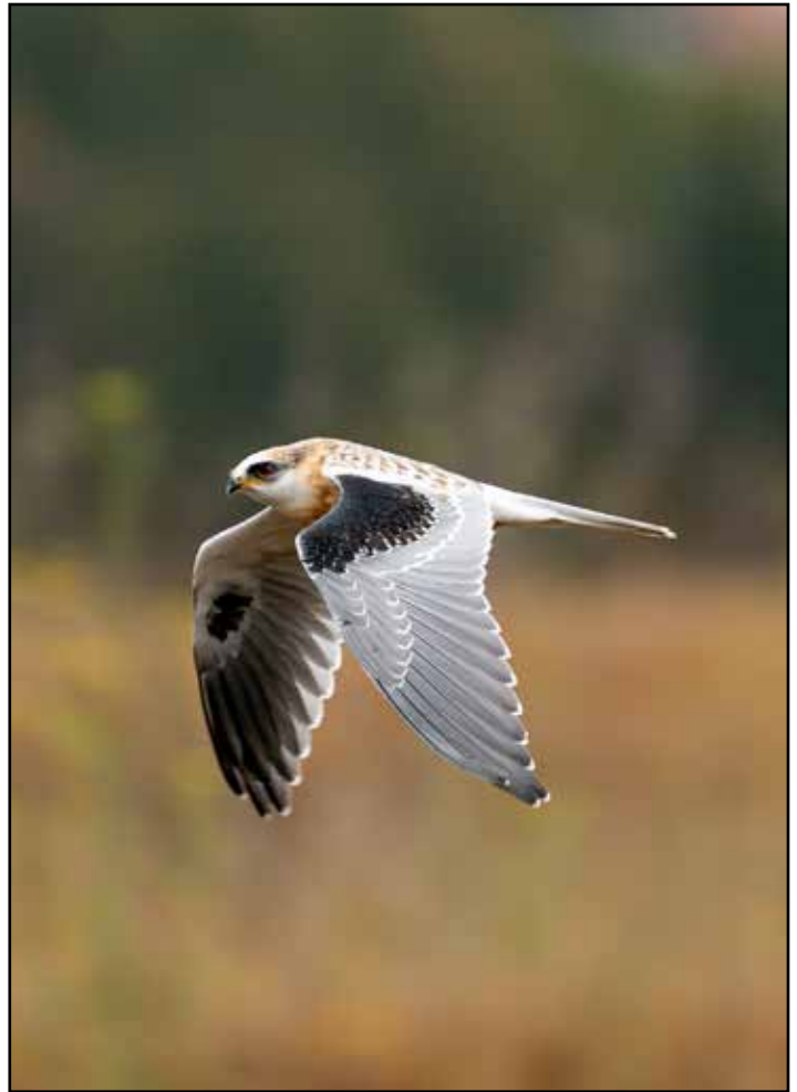
A white-tailed Kite flies on the West Mesa of the San Marcos Foothills. The Foothills were saved by the community from further development in June 2021.