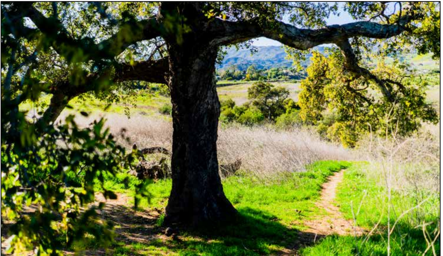
The historic and majestic native oak stands at the entrance to the West Mesa of the Foothills, a significant local cultural landmark.

The passion of every person who volunteered to educate shone through, and I have no doubt that it is exactly that spirit that will attract more like-minded people, and help this community of nature lovers grow into the force that we need to keep preserving and loving our lands.