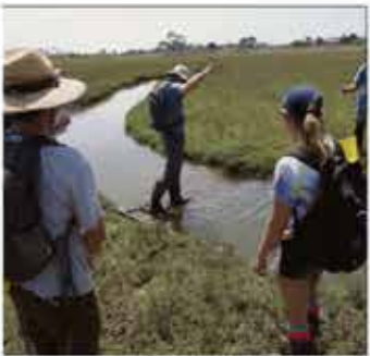
5. Volunteers have some fun!