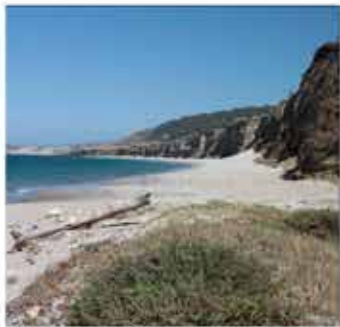
6. Water Canyon Beach on SRI.