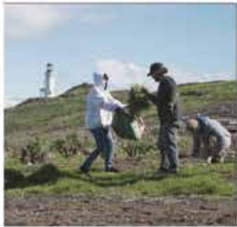
9. Restoration on Anacapa Island.