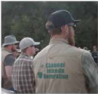
7. A CIR Field Staff with a vest.