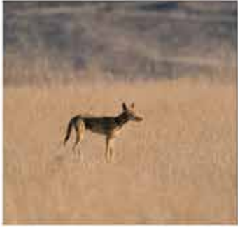
10. A coyote roams the Foothills.