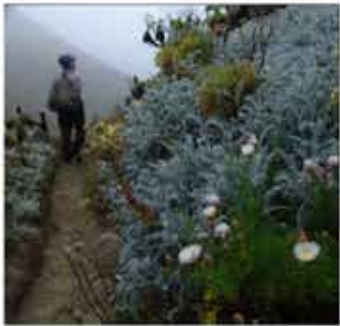
1. Exploring San Miguel Island.