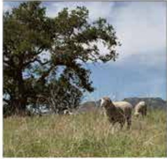
12. Sheep on the SMF Preserve.