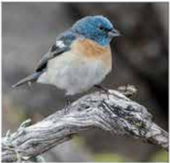
2. Lazuli Bunting, a native bird.