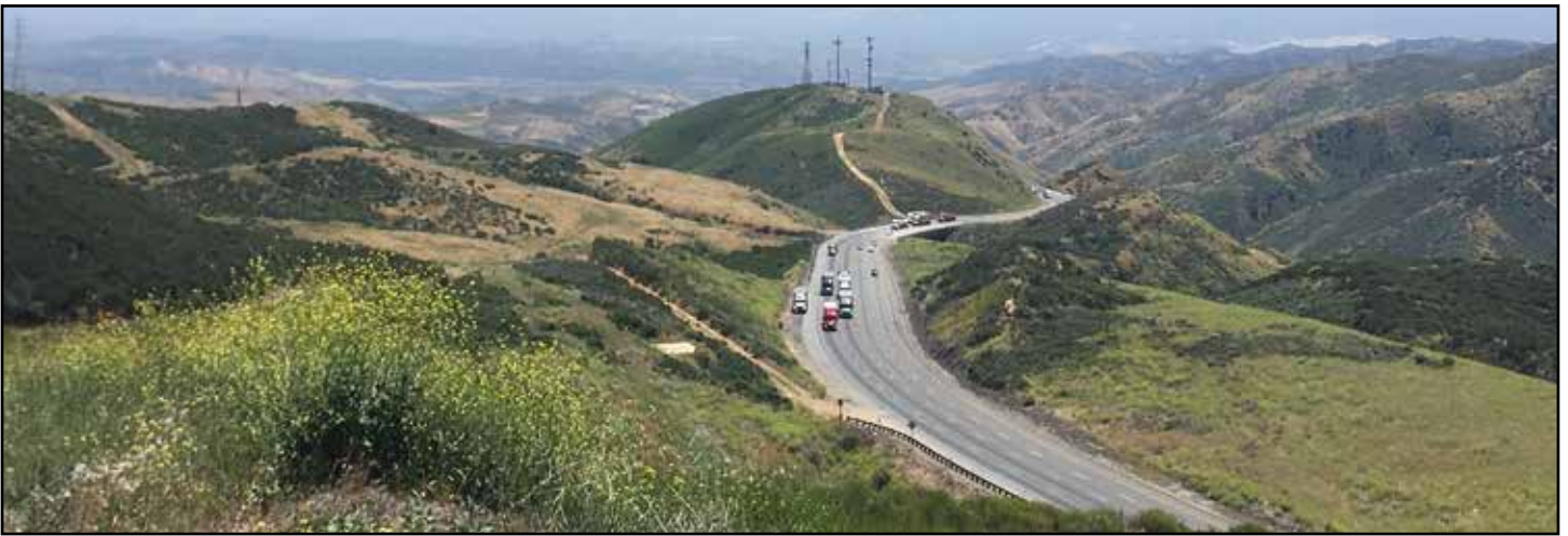
The wild landscape of the Angeles National Forest often makes the pylons and heavy iron pipelines look small. See photos on page 18 and 19.

The work involves a high level of precision, an intimate knowledge of native plants at every stage of growth, and the physical stamina to walk extremely steep mountains in the high desert sun and mountain cold. In other words, this job was practically designed for us!