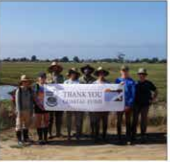
11. Volunteers in Carpinteria.