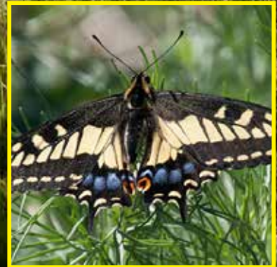
Natives from left-right: Lazuli Bunting, Sara Orangetip, California peony, Sawtooth Goldenbush, Anna's Hummingbird, Anise Swallowtail