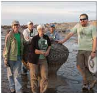
4. A volunteer group on SNI.