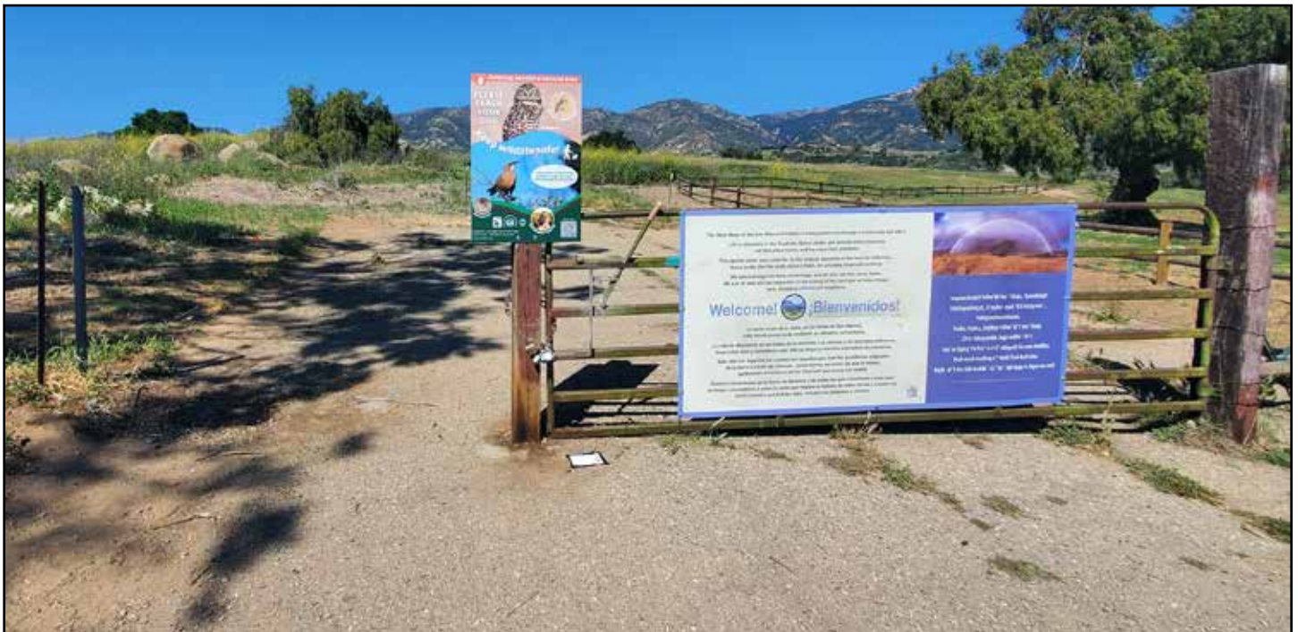
New signs at the Via Gaitero entrance to Foothills, commemorating the saved nature preserve and urging protection for local native species.