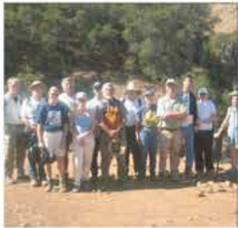
3. Smiles on Santa Cruz Island.