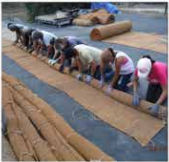
8. Cloud Forest work on SRI.