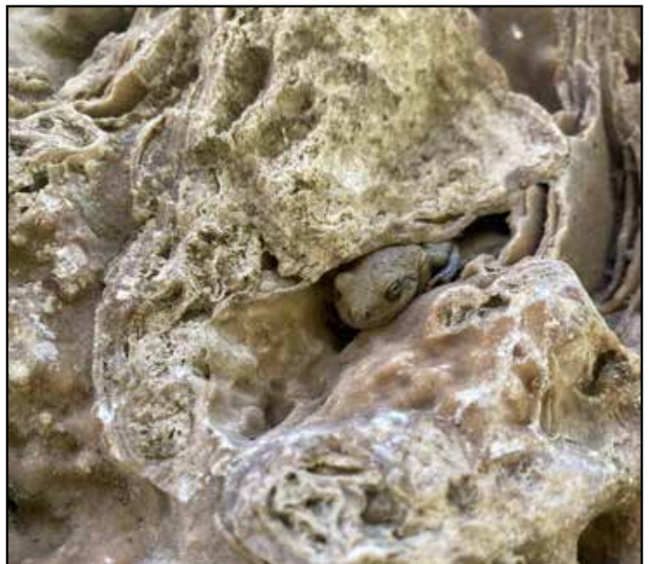
A California Tree Frog sits inside a rock at the bottom of a stream.

Yes, this is hard work, but knowing that our efforts are making the Santa Ynez River system and the Los Padres National Forest a better environment for both plants and animals, including some that are very rare, it is very satisfying work, and once again, I came away very proud to be associated with Channel Islands Restoration.