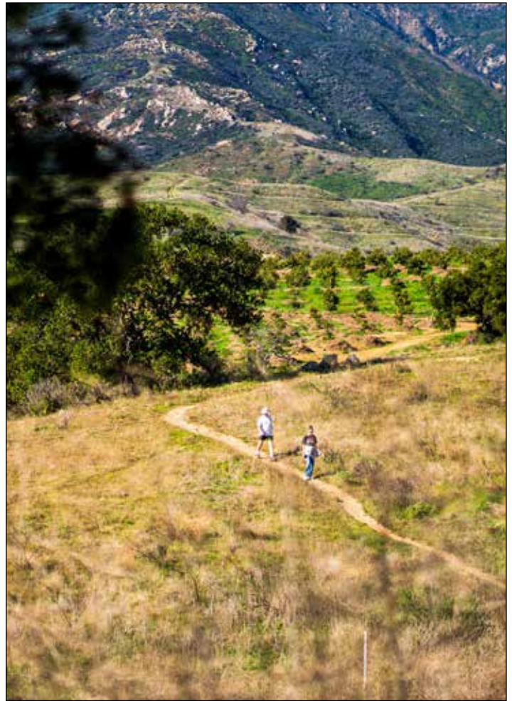
Two hikers walk the West Mesa of the San Marcos Foothills, who's geographic, topographic, and climatic position provides a breathtaking sense of place.