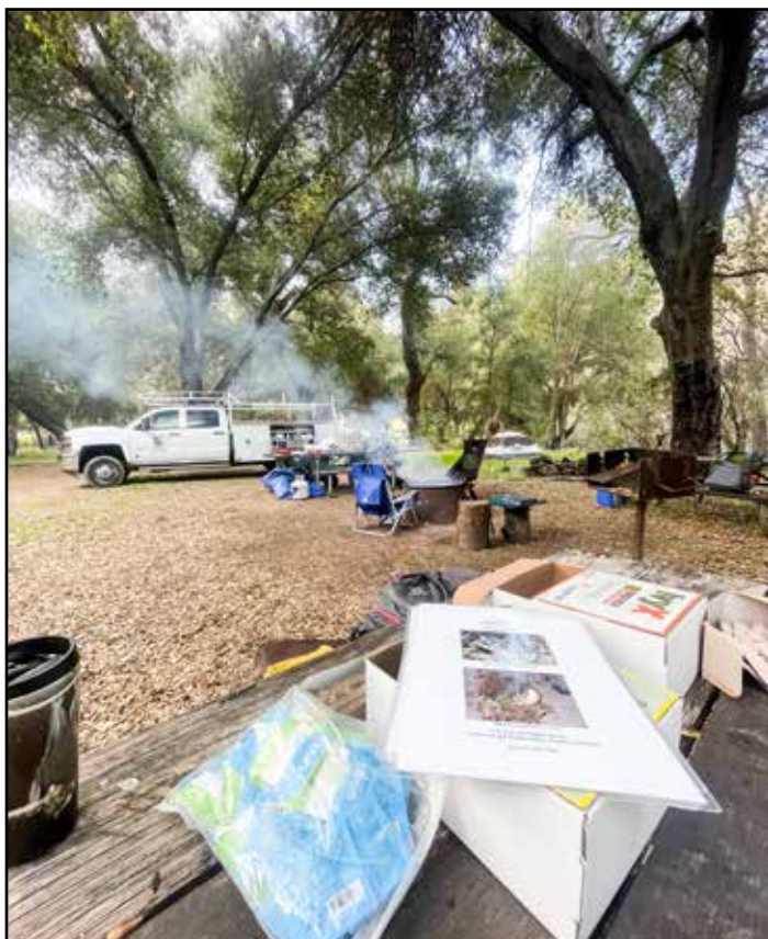
A quiet camp morning before work started.