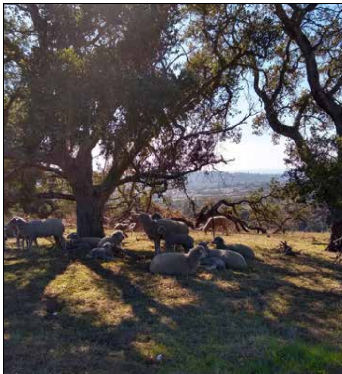
The San Marcos Foothills Preserve is a 200-acre open space of rolling grasslands, oak woodlands, and shaded creeks.

Today, much of the 50 acres of grassland on the Preserve is dominated by invasive non-native grasses, which form a thick homogenous thatch that excludes native growth, inhibits ecosystem nutrient cycling, and provides poor habitat for grassland-dependent birds and other wildlife.