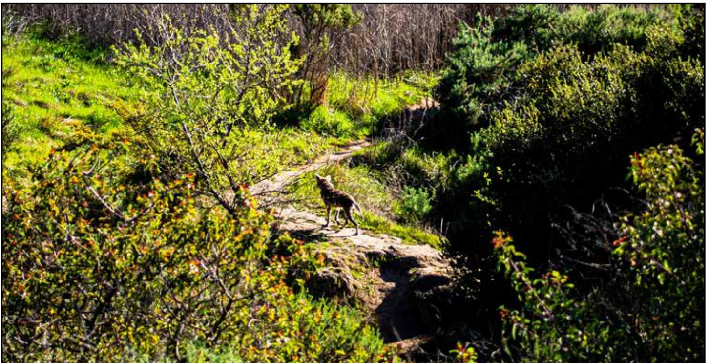
A lone coyote roams the San Marcos Foothills during the day.

The West Mesa of the San Marcos Foothills, with its characteristic grasslands, combines these many features in a way rarely represented and still extant, an important and urgent conservation opportunity that will be lost without the immediate purchase of the West Mesa.