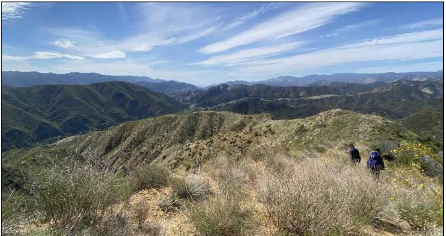
Sometimes we have to climb mountains to get to the creeks.