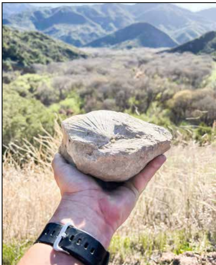
A fossil rock above the view of "The Jungle"