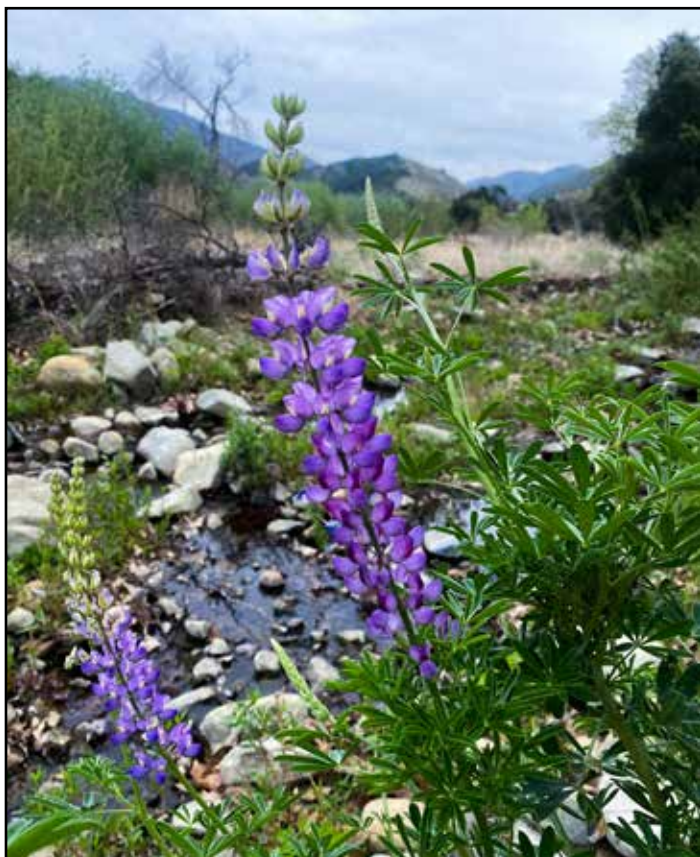
A purple lupin blooms out in the backcountry in April.