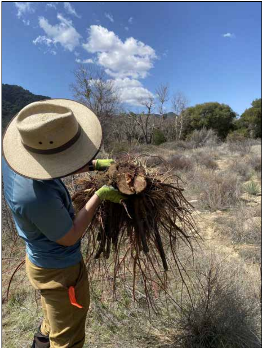
Killing Tamarisk roots and all!

We were required to carefully clean the vehicles' undercarriages, tires, and wheel wells of any dirt or mud that could harbor exotic pests such as the invasive New Zealand mud snail, and our hiking shoes