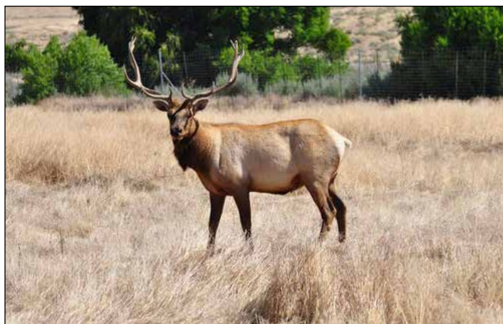
Tule elk were once common in the Santa Barbara area, but today are most commonly found in the Central Valley.