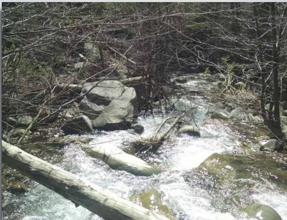
Manzana Creek in February of 2017.

briefly about ecological restoration theory, ecosystems can exist in multiple stable states that resist change. Originally, our native ecosystems would have been able to resist encroachment from invasive species, but with European induced disturbances like land clearing, grazing, logging, or road-building, the balance of our native ecosystems was tipped and novel invasive species were quick to fill the spaces due to the lack of natural bio-controls for such species. Conversely, to restore habitat to their native stable states requires effort to overcome that threshold of disturbance. This means clearing invasives, watering natives so that they can take root, controlling erosion, and putting up barriers to grazing around new plants. These things are not done because our native plants are not adapted to drought, rain, fires, or herbivory, but because proactive work is needed to push the ecosystem out of the invasive state and into the stable native state.