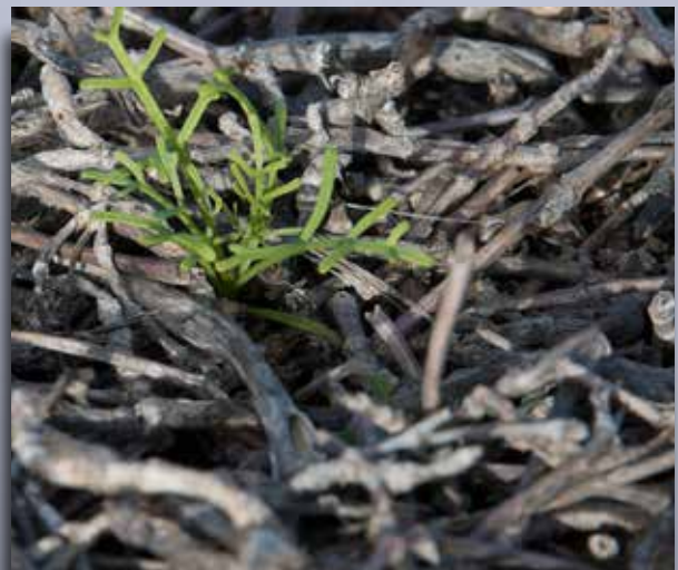
Giant Coreopsis (Leptosyne gigantea) peaks up from beneath the dead ice plant after a little help from the early January rains.

On East Anacapa Island, volunteers and CIR staff have been working hard to eradicate ice plant and replace it with natives. As discussed above, if we plant natives in place of removed invasives, it will help prevent the invasives' reestablishment. On the western end of East Anacapa Island near Inspiration Point, CIR put