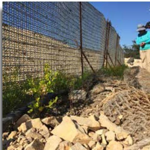
Coyote bush (Baccharus pilularis) is planted between fog drip netting and erosion control waddles. Coyote bush is a hardy and resilient plant making it an excellent candidate for early restoration succession.

which condensed on the leaves and dripped down into the soil. Before ranching changed the ecosystem, this condensation produced enough groundwater to cause streams to flow at the base of the mountains. Today, there wasn't enough vegetation to collect fog and dampen the soil. And if the soil wasn't damp, vegetation couldn't grow on the barren hillsides. To break the contradiction, humans had to step in and jump-start the natural processes of healing. That's where we volunteers from Channel Island Restoration came in.