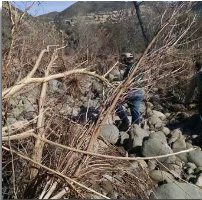
Field crew leader Kevin Thompson navigates through a dense maze of flood debris while moving up a tributary in search of tamarisk.

Five days riding on the backs of mules left us sore but happy, as we scouted the Sisquoc River and Manzana Creek for Tamarisk trees (an invasive species that takes over riparian zones and eliminates nesting habitat for native songbirds). Elihu, Kevin and Daniel investigated the river and creek looking for the invasive tamarisk. The river had flooded just weeks before. The water must have been 6 feet higher than it was when we were there. We could see snags and branches that were high overhead having been washed downstream now resting against the trunks of standing trees.