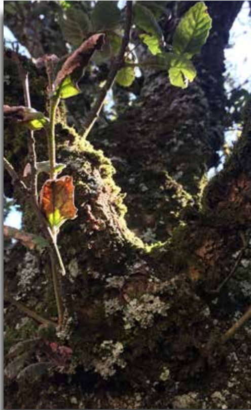
Mosses, lichen, and other water loving organisms thrive beneath the canopy of the Island Oaks.

This article was slightly revised by CIR staff in collaboration with Channel Islands National Park